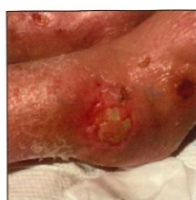
2 YR CHRONIC WOUND

Diabetic Wounds • Decubitus Ulcers • Venous Stasis Ulcers • Pressure Ulcers