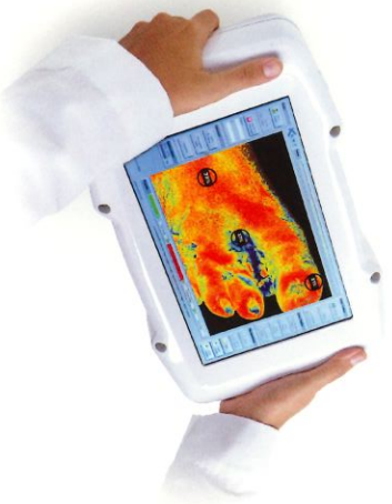
Latest technology used for assessment of wounds and monitoring of the healing process.

In order to make the most from ReSkin's cutting edge wound care procedures and technology, ReSkin providers remain in constant communication with the entire healthcare team. Primary care providers, home health companies, vascular specialists and Hospital Based Wound clinics are invaluable partners in addressing and healing these chronic and complex problems.