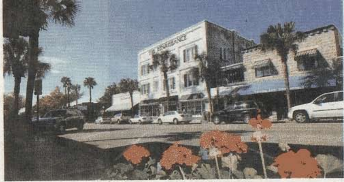
Mount Dora is known for the Lakeside Inn (left) and its shopping district with antiques shops, restaurants, boutiques and specialty stores.