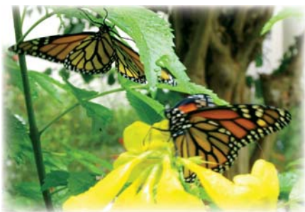
Two newly released Monarch butterflies linger in Jessie's Garden.

Bridgewater was immanently enriched this month by raising monarch butterflies from